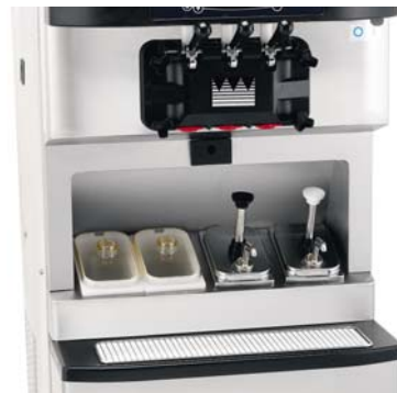
Integrated Syrup Rail Option - 2 room temperature with lids & ladles, 2 heated with syrup pumps

During long no-use periods, the standby feature maintains safe product temperatures in the mix hopper and freezing cylinder.