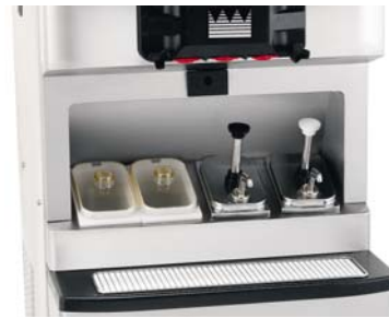
Integrated Syrup Rail Option - 2 room temperature with lids & ladles, 2 heated with syrup pumps

During long no-use periods, the standby feature maintains safe product temperatures in the mix hopper and freezing cylinder.